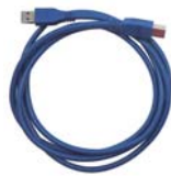
USB 3.0 cable